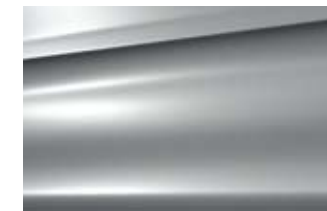
Arctic Steel (metallic)