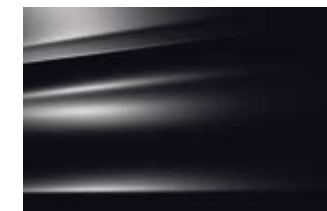
Obsidian Black (pearlescent)